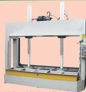
AKS - IR100T