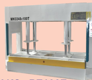
AKS - RT100T